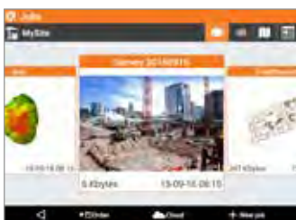
Selecting a saved job in X-PAD