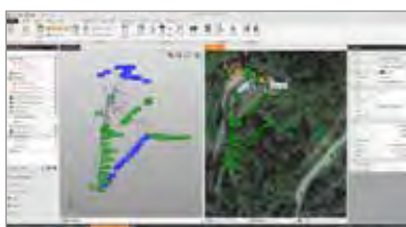
Topographic Survey Points