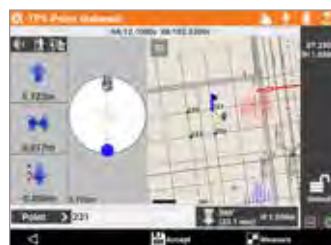
TPS point stakeout

A variety of localisation options makes it easy to integrate your data with multiple map types and switch background coordinate systems with no effort.