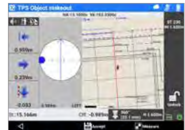
TPS Stakeout in X-PAD Build

Discover X-PAD Ultimate Build, the ideal, user-friendly field software for your construction measuring and layout needs. It combines data from total stations or GNSS receivers, allowing you to perform measurements, stakeout and as-built with simple and functional procedures. The different mode of the TPS as a reference axis, intersection of two axes and batter boards, make it possible to proceed with tracking operations even in difficult conditions and with few reference points.