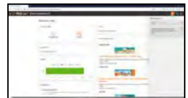
X-PAD 365 personalised dashboard