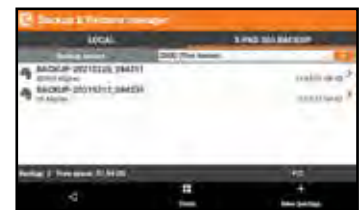
Back up and restore files in X-PAD 365