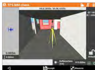
TPS BIM Check