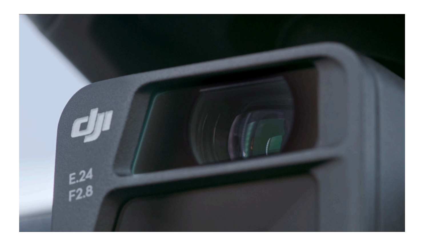
Focus and Find

Mavic 3E's Wide camera has large 3.3\mu m pixels that, together with intelligent low-light mode, offer significantly improved performance in dim conditions.