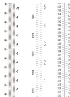
15a 0.5 cm