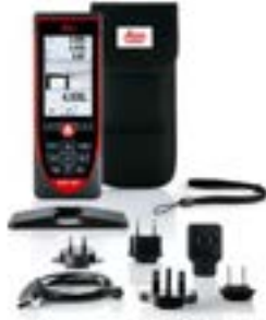
Leica DISTO™ S910 Art. No. 805080 Art. No. 808183 for U.S.

Leica DISTO™ S910, pouch, adapter for corner measurement, set-up plate for Smart Base, hand loop, USB charger, Calibration Certificate Silver, quick start guide