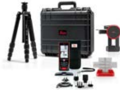
Leica DISTO™ S910 P2P package Art. No. 887900

Leica DISTO™ S910, pouch, adapter for corner measurement, set-up plate for Smart Base, hand loop, USB charger, Calibration Certificate Silver, quick start guide